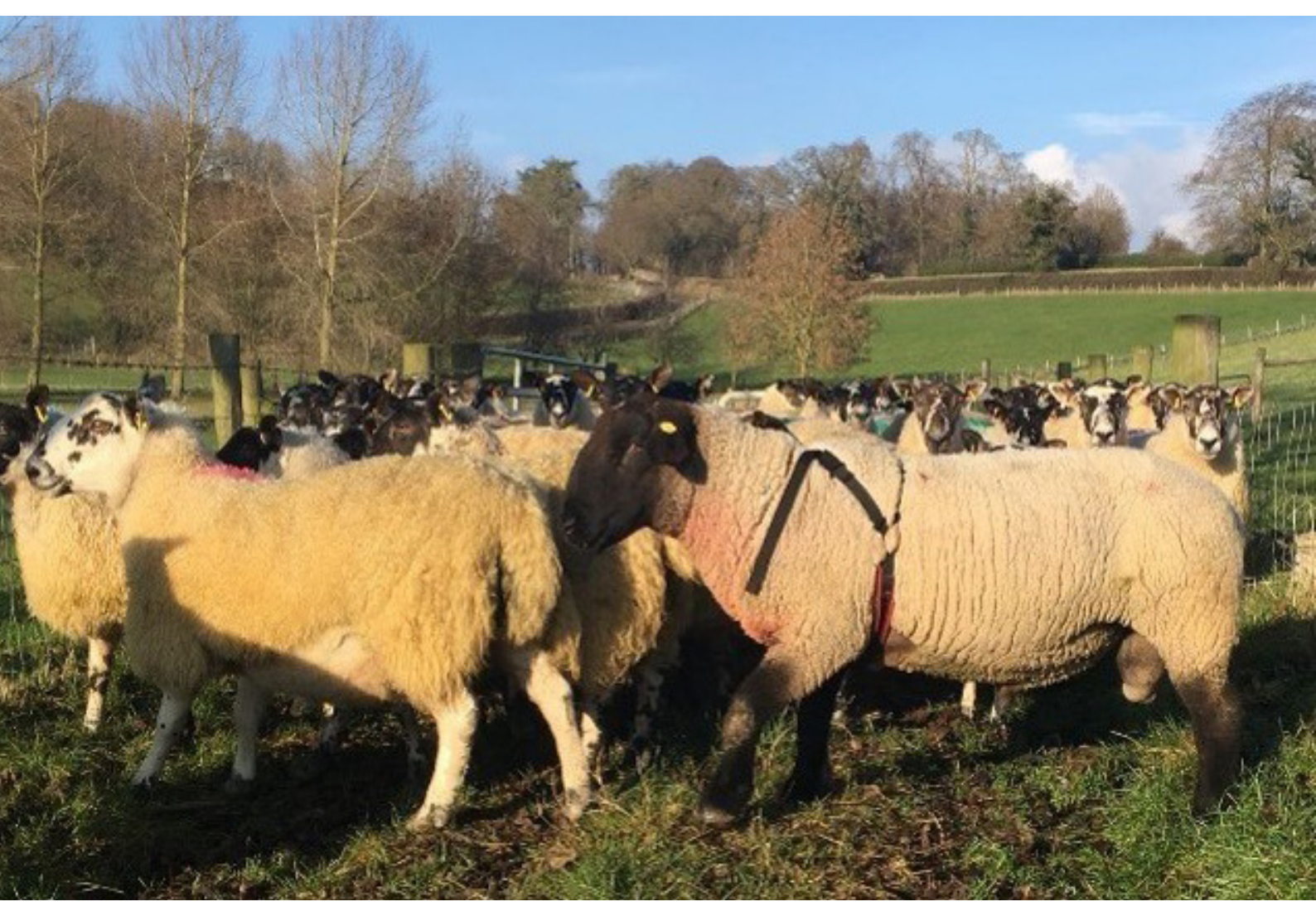
Suffolk and Texel recorded rams were used in the study