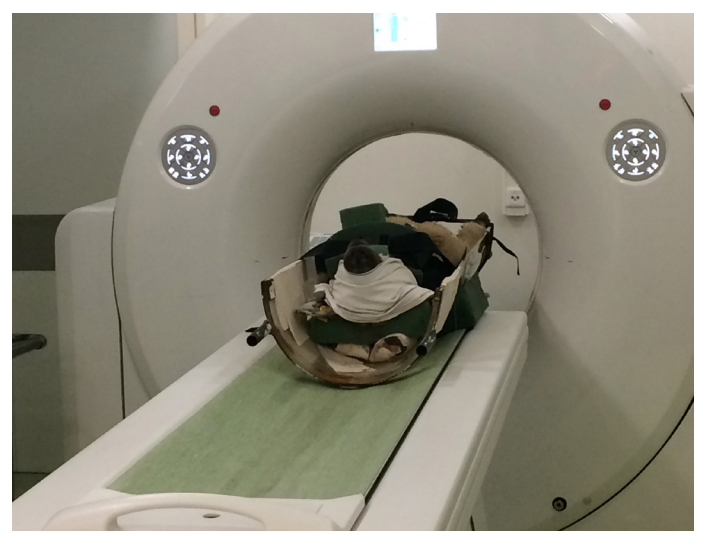
Lamb in CT scanner

CT scanning was used to determine the weight of muscle, fat and bone in each third of the lamb.